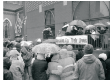
The Rally in the Cathedral Plaza drew many who stayed despite the freezing cold, rainy weather.

Go to http://www.prolifedallas.org/pages/2007_Roe_Events for pictures, media and a report of the day.